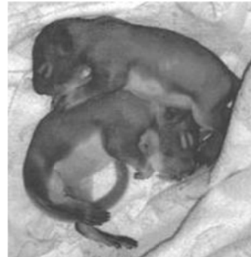
Baby squirrels fed powdered squirrel formula