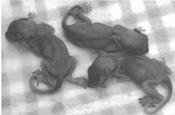
Baby squirrels fed Hartz kitten milk for 10 days

Inexperienced people trying to raise squirrels will feed them what they believe is healthy food, assuming that because the animals are eating they are doing fine. However, in comparison with the healthy baby squirrels in the bottom right shows that these squirrels are actually starving!